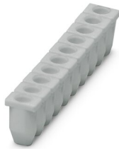
Insulating sleeve, color: gray

https://www.phoenixcontact.com/us/products/3031034