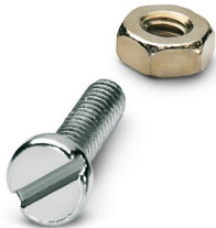
Screw, for attaching cable lugs to FAME test plugs, with cover, without test point, length: 4.5 mm, height: 4.5 mm, color: silver/black

https://www.phoenixcontact.com/us/products/3069467