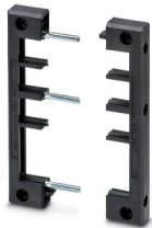
Sealing frame, material: PA, color: black, length: 147 mm, width: 58 mm, height: 17 mm

Please be informed that the data shown in this PDF document is generated from our online catalog. Please find the complete data in the user documentation. Our general terms of use for downloads are valid.