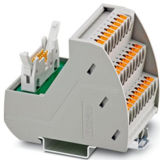
VARIOFACE sensor module, with push-in connection, for connecting 8 pnp sensors

https://www.phoenixcontact.com/pc/products/2904282