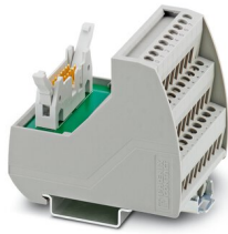
VARIOFACE sensor module, for connecting 8 pnp sensors

https://www.phoenixcontact.com/pc/products/2322278