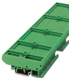
Electronic board base, plug-in module base element

Please be informed that the data shown in this PDF document is generated from our online catalog. Please find the complete data in the user documentation. Our general terms of use for downloads are valid.