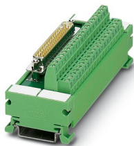
VARIOFACE module, with screw connection and D-subminiature pin strip, for assembly on NS 35/7.5, 9 positions

Please be informed that the data shown in this PDF document is generated from our online catalog. Please find the complete data in the user documentation. Our general terms of use for downloads are valid.