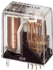
KAMMRELAIS®, contact B 110, size 2, dry contact, 4 changeover contacts, input voltage 220 V DC

Please be informed that the data shown in this PDF document is generated from our online catalog. Please find the complete data in the user documentation. Our general terms of use for downloads are valid.