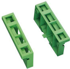
Side element, with marker groove, labeling with SS-ZB. Width: 11 mm, length: 45 mm, height: 21 mm

Please be informed that the data shown in this PDF document is generated from our online catalog. Please find the complete data in the user documentation. Our general terms of use for downloads are valid.