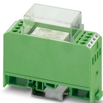
Relay module, with soldered-in miniature switching relay, contact (AgNi): medium to large loads, 1 changeover contact, input voltage 24 V AC/DC

Please be informed that the data shown in this PDF document is generated from our online catalog. Please find the complete data in the user documentation. Our general terms of use for downloads are valid.