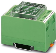
Diode module, with 8 diodes, individually wired, diode type 1N 4007

Please be informed that the data shown in this PDF document is generated from our online catalog. Please find the complete data in the user documentation. Our general terms of use for downloads are valid.