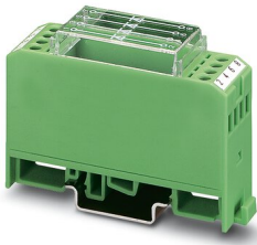
Diode module, with 4 diodes, individually wired, diode type 1N 4007

Please be informed that the data shown in this PDF document is generated from our online catalog. Please find the complete data in the user documentation. Our general terms of use for downloads are valid.