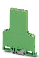
Power solid-state relay, with LED and protective circuit in input and output circuits, input: 5 V DC, output: 5 - 36 V DC/ max. 1 A

Please be informed that the data shown in this PDF document is generated from our online catalog. Please find the complete data in the user documentation. Our general terms of use for downloads are valid.