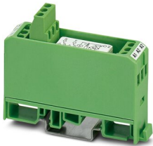
Relay module, with soldered-in miniature switching relay, contact (AgNi): medium to large loads, 2 changeover contacts, input voltage 24 V AC/DC

Please be informed that the data shown in this PDF document is generated from our online catalog. Please find the complete data in the user documentation. Our general terms of use for downloads are valid.