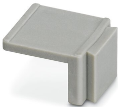
Equipment marker, narrow