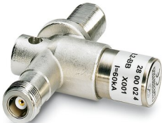
Attachment plug with Lambda/4 technology as surge protection for coaxial signal interfaces. Connection: N connectors socket-socket

Please be informed that the data shown in this PDF document is generated from our online catalog. Please find the complete data in the user documentation. Our general terms of use for downloads are valid.