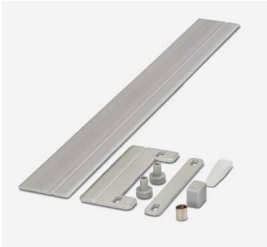
DIN rail, for larger distance between coil and transformer terminal, aluminum, 2 x 35 mm, length: 1 m

Please be informed that the data shown in this PDF document is generated from our online catalog. Please find the complete data in the user documentation. Our general terms of use for downloads are valid.