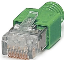
RJ45 connector, design: RJ45, degree of protection: IP20, number of positions: 8, 1 Gbps, CAT5 (IEC 11801:2002), material: Plastic, connection method: Crimp connection, connection cross section: AWG 26- 24, cable outlet: straight, color: green, Ethernet

https://www.phoenixcontact.com/us/products/2744856