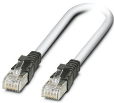
Patch cable, CAT5, assembled, 5 m

https://www.phoenixcontact.com/us/products/2832580