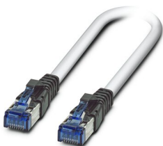
Patch cable, CAT6, preassembled, 20.0 m

https://www.phoenixcontact.com/us/products/2891576