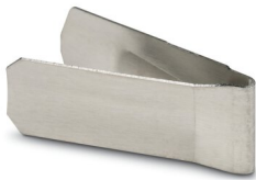
PCB safety clip

https://www.phoenixcontact.com/us/products/2230012