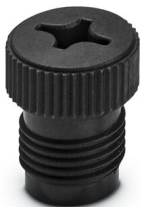
An M12 screw plug for the unoccupied M12 sockets of the sensor/actuator cable, boxes and flush-type connectors

https://www.phoenixcontact.com/us/products/1680539