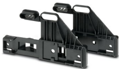
Mounting set for mast mounting