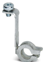
PE contact for UM-BASIC panel mounting base for connecting the PCB to the DIN rail at level 3

Please be informed that the data shown in this PDF document is generated from our online catalog. Please find the complete data in the user documentation. Our general terms of use for downloads are valid.