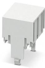
DIN rail housing, 2U, Housing cover, width: 18.9 mm, height: 21.8 mm, depth: 26 mm, color: light grey (7035)

Please be informed that the data shown in this PDF document is generated from our online catalog. Please find the complete data in the user documentation. Our general terms of use for downloads are valid.