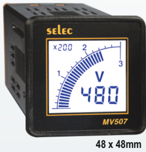
48 x 48mm