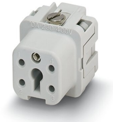
HEAVYCON female insert, A4 series, 4-pos., screw connection without wire protection, with IP65 sealing screw

Please be informed that the data shown in this PDF document is generated from our online catalog. Please find the complete data in the user documentation. Our general terms of use for downloads are valid.