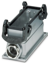
Box mounting base, with double locking latch, height 67 mm, with screw connection, 1x Pg21

Please be informed that the data shown in this PDF document is generated from our online catalog. Please find the complete data in the user documentation. Our general terms of use for downloads are valid.