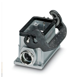
Box mounting base, with single locking latch, height 52 mm, with screw connection, 1x Pg16

Please be informed that the data shown in this PDF document is generated from our online catalog. Please find the complete data in the user documentation. Our general terms of use for downloads are valid.