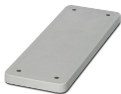
HEAVYCON cover plate, for wall cutouts of type B24, 7 mm thick, gray

Please be informed that the data shown in this PDF document is generated from our online catalog. Please find the complete data in the user documentation. Our general terms of use for downloads are valid.