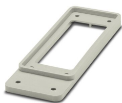
HEAVYCON adapter plate, type B24 on B16, for panel cutouts of type B24, gray

Please be informed that the data shown in this PDF document is generated from our online catalog. Please find the complete data in the user documentation. Our general terms of use for downloads are valid.