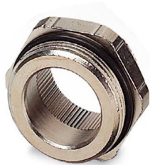
Cable gland for Pg21 half screw connection to M32 housing entry, metal

Please be informed that the data shown in this PDF document is generated from our online catalog. Please find the complete data in the user documentation. Our general terms of use for downloads are valid.