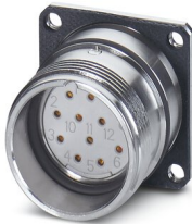
Device connector, rear mounting, M23, degree of protection: IP67, connection method: Solder connection, Alternative product in accordance with RoHS II without Exemption 6c (Pb <0.1%) item no.: 1240547

Please be informed that the data shown in this PDF document is generated from our online catalog. Please find the complete data in the user documentation. Our general terms of use for downloads are valid.