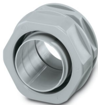
Cable gland made from PP with Pg thread, IP65 protection

https://www.phoenixcontact.com/us/products/3240994