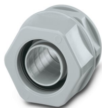
Cable gland made from PP with Pg thread, IP65 protection

https://www.phoenixcontact.com/us/products/3240992