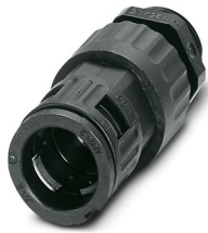
Cable gland, metric thread, IP66 protection, with strain relief

https://www.phoenixcontact.com/us/products/3240955