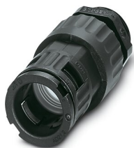
Cable gland, metric thread, IP68/69k protection, with strain relief

https://www.phoenixcontact.com/us/products/3240941