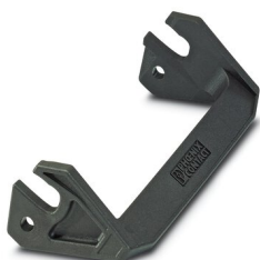
Single locking latch for B24 housing, HC-EVO....AL and HC-STA....AL

Please be informed that the data shown in this PDF document is generated from our online catalog. Please find the complete data in the user documentation. Our general terms of use for downloads are valid.