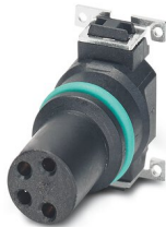
Contact carrier, 4-position, Socket, straight, M8, coding: A, PCB mounting, SMD reflow, Alternative product in accordance with RoHS II without Exemption 6c (Pb <0.1%) item no.: 1308273

Please be informed that the data shown in this PDF document is generated from our online catalog. Please find the complete data in the user documentation. Our general terms of use for downloads are valid.