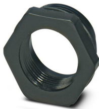
Reducing adapter, connecting thread: M32 x 1.5, color: jet black, with flat gasket

Please be informed that the data shown in this PDF document is generated from our online catalog. Please find the complete data in the user documentation. Our general terms of use for downloads are valid.