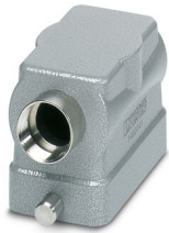
HEAVYCON B6 sleeve housing, for single locking latch, height: 56 mm, with 1 x Pg16 gland, lateral cable outlet

Please be informed that the data shown in this PDF document is generated from our online catalog. Please find the complete data in the user documentation. Our general terms of use for downloads are valid.