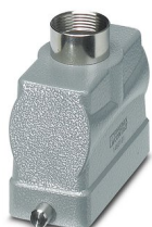
HEAVYCON B16 sleeve housing, for single locking latch, height: 65 mm, with 1 x M25 gland, straight cable outlet

Please be informed that the data shown in this PDF document is generated from our online catalog. Please find the complete data in the user documentation. Our general terms of use for downloads are valid.