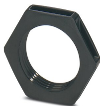
Panel feed-through, Range of articles: PRC 35, Nut, color: black

Please be informed that the data shown in this PDF document is generated from our online catalog. Please find the complete data in the user documentation. Our general terms of use for downloads are valid.