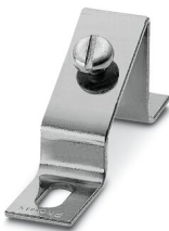
Angled brackets with M 6 screw, for fixing DIN rails at an angle of 30°, height: 35.4 mm

Please be informed that the data shown in this PDF document is generated from our online catalog. Please find the complete data in the user documentation. Our general terms of use for downloads are valid.