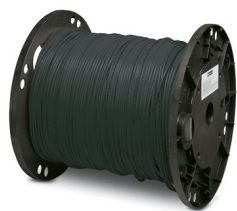
Cable reel, 4-position, cable length: 300 m

Please be informed that the data shown in this PDF document is generated from our online catalog. Please find the complete data in the user documentation. Our general terms of use for downloads are valid.