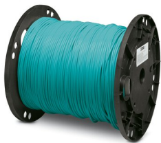
Cable reel, 4-position, cable length: 100 m

Please be informed that the data shown in this PDF document is generated from our online catalog. Please find the complete data in the user documentation. Our general terms of use for downloads are valid.