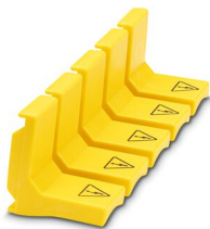
Protective covers for TMC 7 single-pole bus bars. Cuttable, five positions, yellow.

Please be informed that the data shown in this PDF document is generated from our online catalog. Please find the complete data in the user documentation. Our general terms of use for downloads are valid.