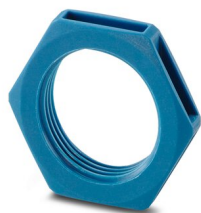
Panel feed-through, Range of articles: PRC 35, Nut, color: blue

Please be informed that the data shown in this PDF document is generated from our online catalog. Please find the complete data in the user documentation. Our general terms of use for downloads are valid.