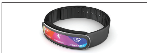
Wearables (Smart Watches, Health Monitors, AR & VR)