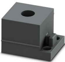
Cable sleeve, small, no. of conductors: 1, type: Round cable, slotted, external cable diameter: 1x 4 mm ... 5 mm, material: NBR, color: black, length: 29.5 mm, width: 19.5 mm, height: 17 mm

Please be informed that the data shown in this PDF document is generated from our online catalog. Please find the complete data in the user documentation. Our general terms of use for downloads are valid.