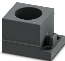
Cable sleeve, small, no. of conductors: 1, type: Round cable, slotted, external cable diameter: 1x 12 mm ... 13 mm, material: NBR, color: black, length: 29.5 mm, width: 19.5 mm, height: 17 mm

Please be informed that the data shown in this PDF document is generated from our online catalog. Please find the complete data in the user documentation. Our general terms of use for downloads are valid.