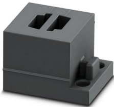
Cable sleeve, small, no. of conductors: 2, type: AS-i cable (Right Right), slotted, material: NBR, color: black, length: 29.5 mm, width: 19.5 mm, height: 17 mm

Please be informed that the data shown in this PDF document is generated from our online catalog. Please find the complete data in the user documentation. Our general terms of use for downloads are valid.