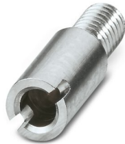
Female test connector, number of positions: 1, color: silver

Please be informed that the data shown in this PDF document is generated from our online catalog. Please find the complete data in the user documentation. Our general terms of use for downloads are valid.