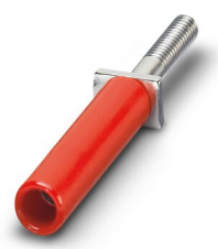
Female test connector, number of positions: 1, color: red

Please be informed that the data shown in this PDF document is generated from our online catalog. Please find the complete data in the user documentation. Our general terms of use for downloads are valid.