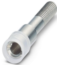
Female test connector, number of positions: 1, color: silver

Please be informed that the data shown in this PDF document is generated from our online catalog. Please find the complete data in the user documentation. Our general terms of use for downloads are valid.