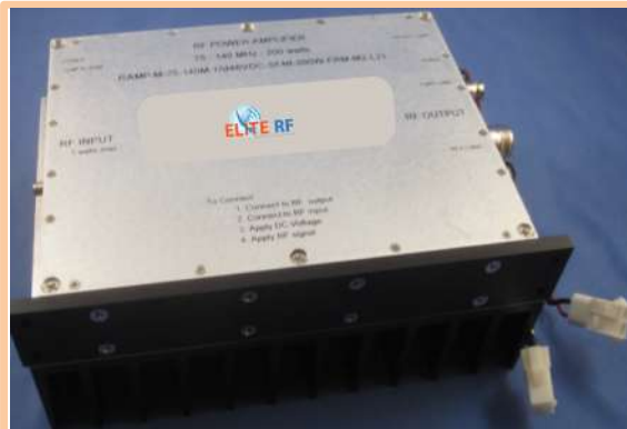
150 watts 75 to 140 MHz 48 VDC