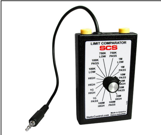
Figure 1. SCS 770751 Limit Comparator